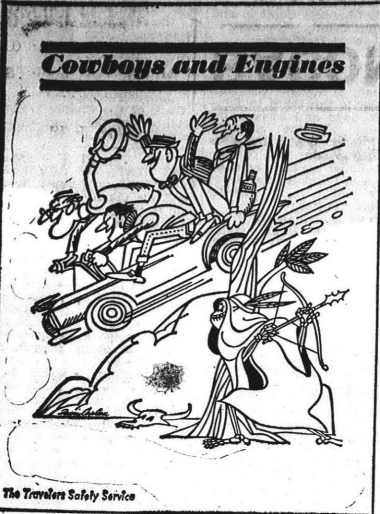
Cowboys with engines caused more than 3,000,000 casualties in 1961.

sell the poppys on the square, she said.