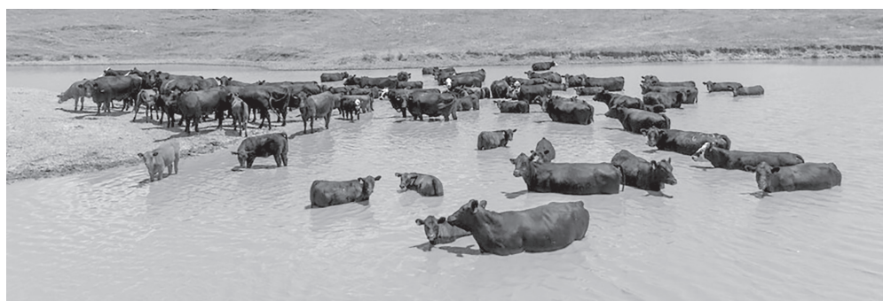
CRAIG CHANDLER | UNIVERSITY COMMUNICATION AND MARKETING

"In terms of policy, it's important to know producers' attitudes toward that policy and preferences for different policy features. Are they willing to make changes to their decisions on their operations? We want to make sure we're reducing bar-