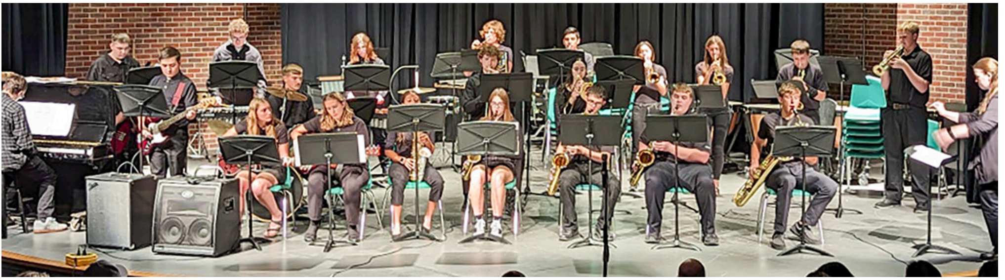
The Wilber-Clatonia jazz band performs in concert during the 2023-24 school year.