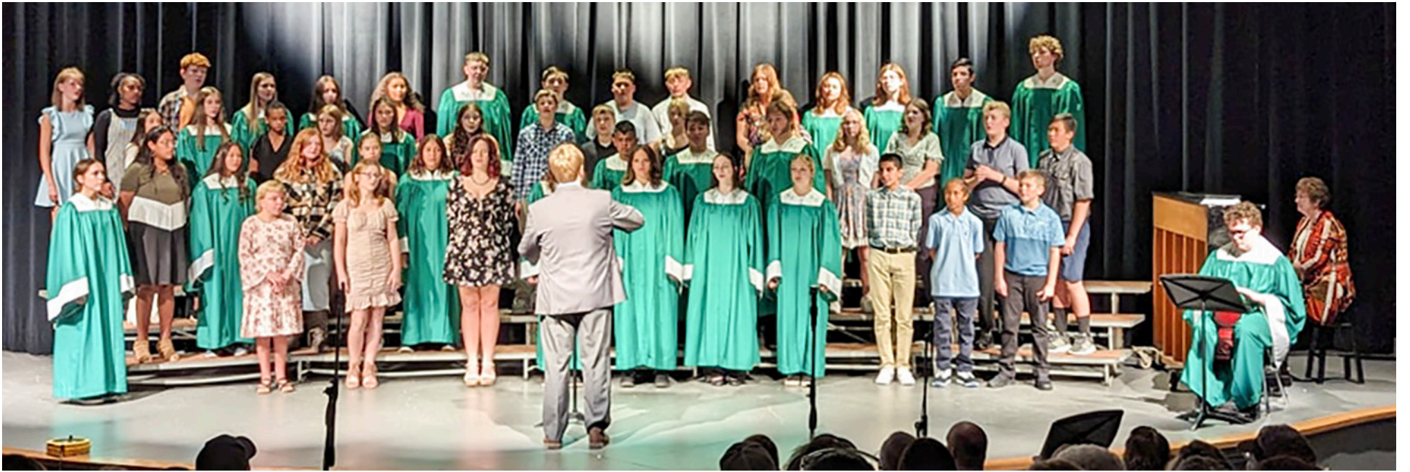
The Wilber-Clatonia choir performs a concert during the 2023-24 school year.