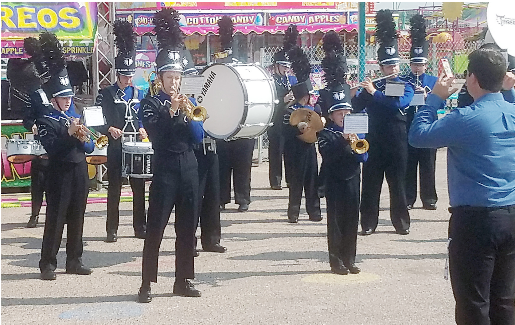
The Exeter-Milligan High band performs at the Nebraska State Fair last fall.