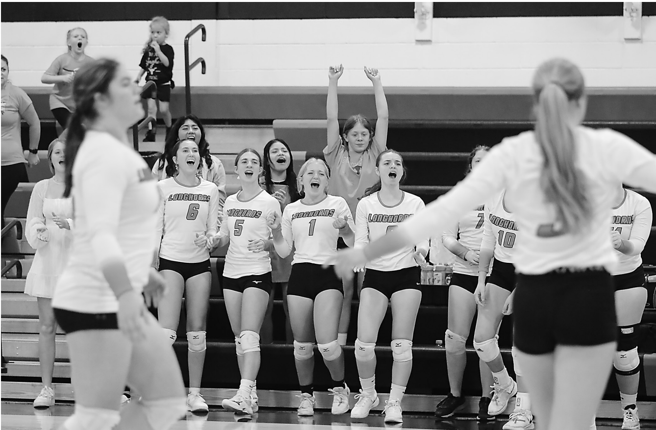
Members of the Longhorns bench celebrate a point Sept. 26 during the Longhorns home victory over Sterling. The Longhorns broke two records during the 2023 season.