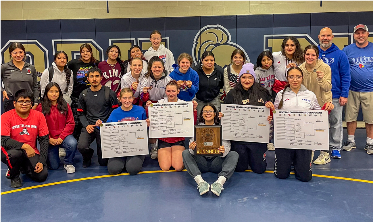
The Crete girls' wrestling team poses with its Central Conference runner up plaque on Jan. 26.

Crete (16-0) was scheduled to travel to Schuyler on Jan. 30 and host Wahoo on Thursday, Feb. 1, for an 8 p.m. start time.