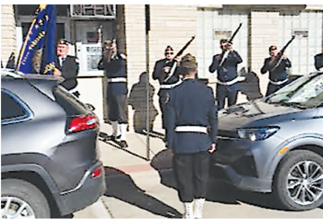
A 21-gun salute was carried out at 11 a.m. during a Veterans Day ceremony Nov. 11 at Veterans & Friends in Crete.