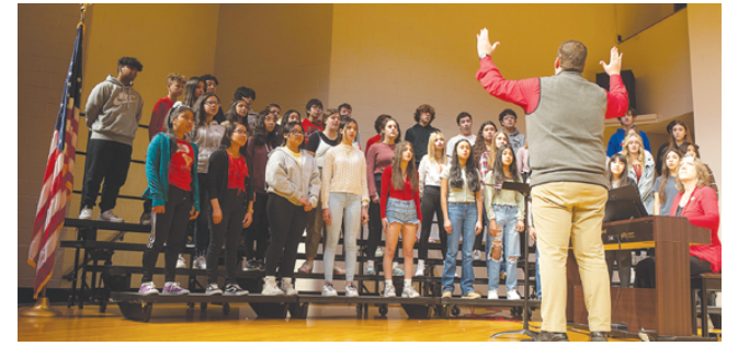
Members of the Crete Middle School choir perform Nov. 11 at the school's Veterans Day program.