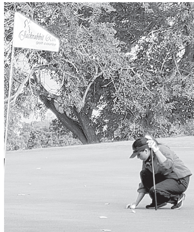
Melissa Castillo of Crete lines up her putt at the B3 district meet on Oct. 4. Castillo shot a 145.