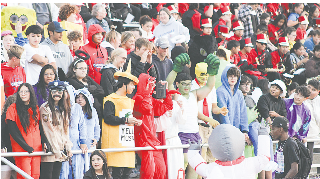
Students of Crete High School showed their school spirit in the student section by dressing up in costumes for the football game against Beatrice on Oct. 6.